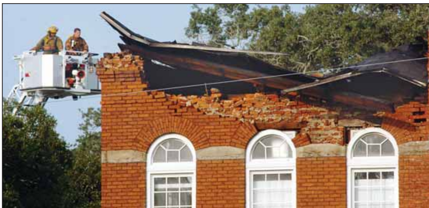
Firefighters rise above the Glynn Academy Annex at about 9 a.m. Friday to survey fire damage.