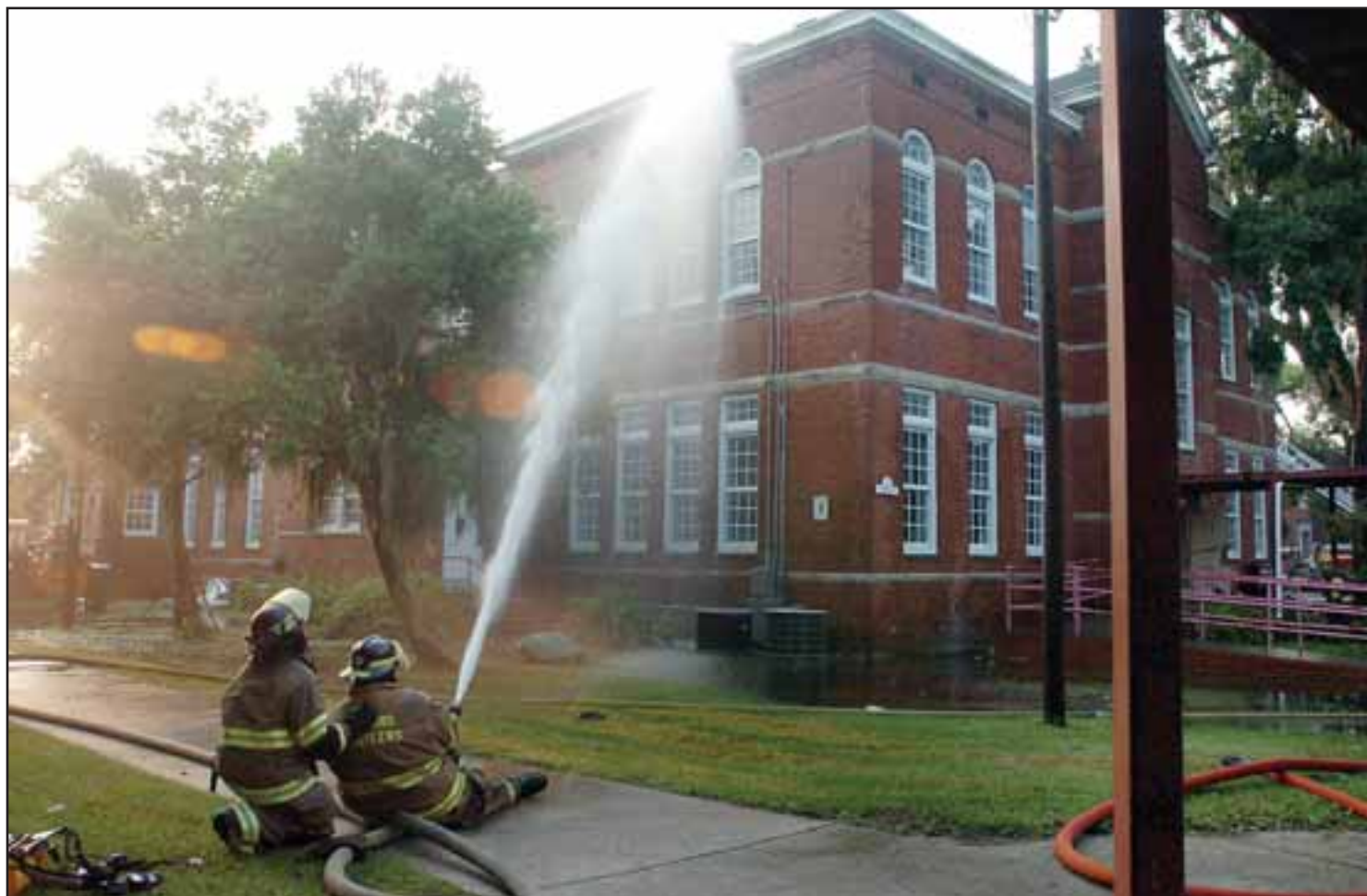
Firefighters on the ground battle the blaze at the Glynn Academy Annex at about 7:30 a.m. Friday.